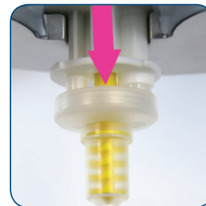
6. Place tip on cartridge, ensuring hex rod is fully engaged with mixing element.