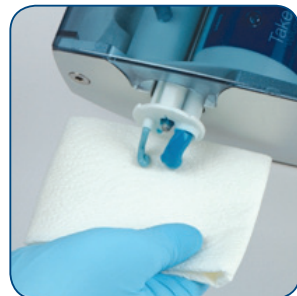
5. Bleed cartridge to ensure adequate mix.