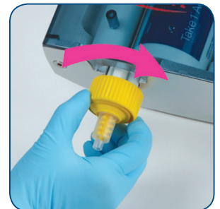
7. Place bayonet ring over mix tip and turn clockwise until secure.