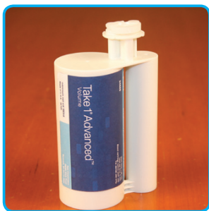
1. Place cartridge on surface with nozzles facing up.