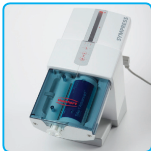
4. Place cartridge in mixing machine. Follow manufacturer's instructions.